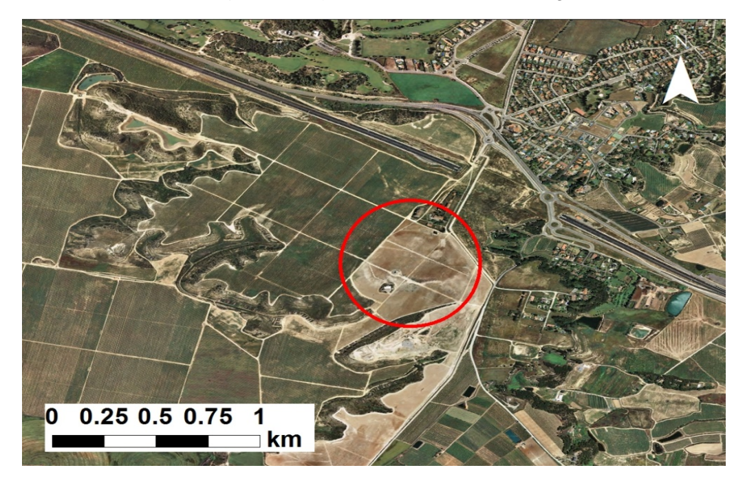
Figure 5: RAIMAT plot location

The assay will be located in an experimental plot in Raïmat (Lleida, Spain). The location (Figure 5) is within the Segre watershed (13.000 km<sup>2</sup>), which is the most important agricultural area of Catalonia (4.420 km<sup>2</sup>), with 1.400 km<sup>2</sup> under irrigation.