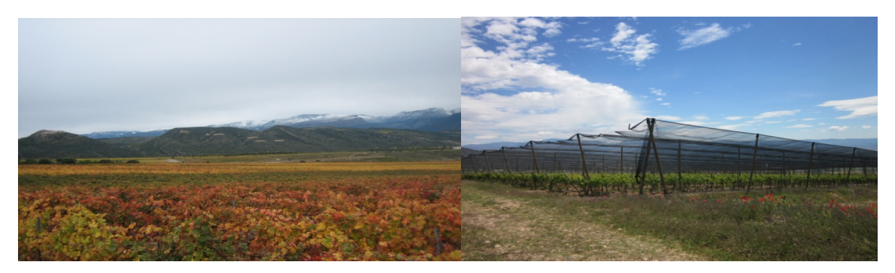
Figure7: General view of altitude assay in Finca Sant Miquel

The objective of this demonstrative activity is to obtain information about the response of short cycle varieties to cool climates, because excessive temperature can reduce the quality of the grapes.