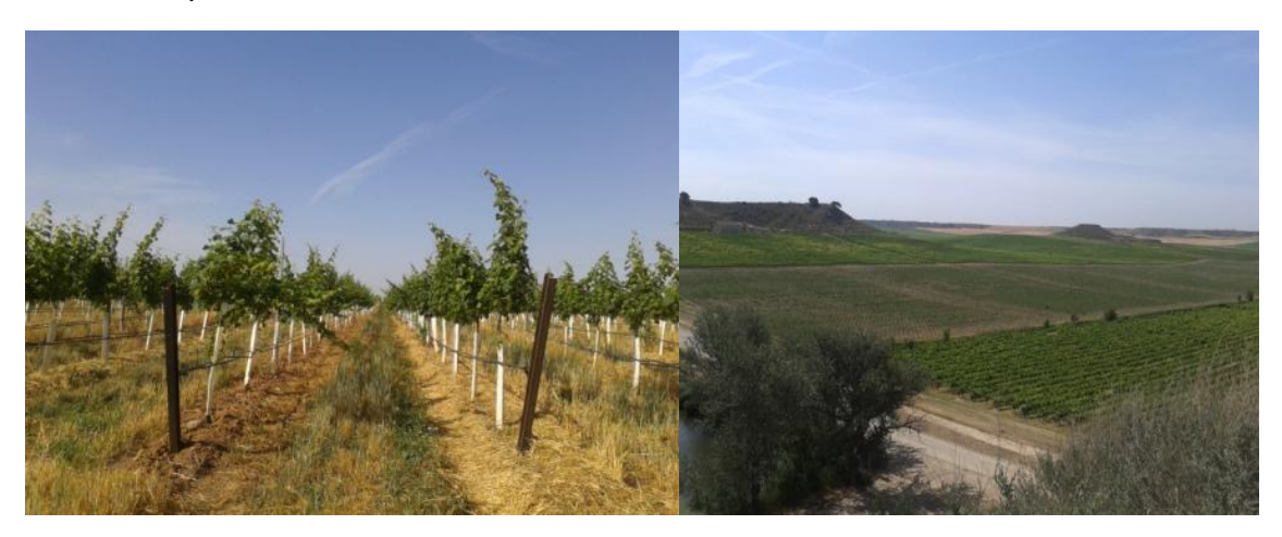
Figure 6: General view of mulching assay in the vineyard plot

The assay will be conducted in a vineyard of 4-year old Cabernet Sauvignon grafted onto 110-R rootstock (figure 6), irrigated with a dose of 235 mm/year. The crop will receive a fertilization input of 28 N, 65 K, 15 P.